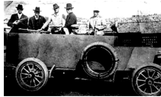
The Death Special protected Rockefeller's interests